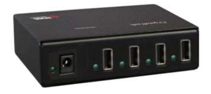
Rear view 4-port