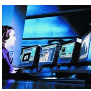
View single, dual, and quad video 1,000 feet away

set-up is needed; just connect the serial device to the serial port and it's ready to use.