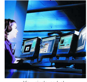
View single, or dual, video 1,000 feet away