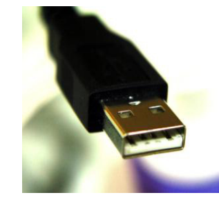
Extend your USB device up to 330 feet over industry standard CAT5 cable

If additional USB devices need to be connected to the receiver, you can add up To 3 USB hubs to increase the number of USB devices to 11.