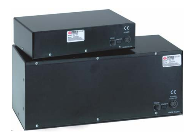
Rear view of MultiStation models ML-2U and ML-4U

Phone: 281-933-7673 E-mail: sales@rose.com 10707 Stancliff Rd. Houston, TX 77099 Rose Electronics – Europe: +49 (0)2454 969442 Rose Electronics – Asia: +65 6324 2322 DS-ML 1.9 © Copyright 2004 Rose Electronics. All rights reserved