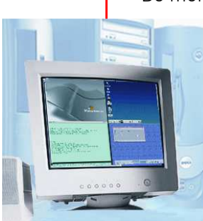
Real-time quad view

the dynamic, new QuadraVista 2, Quad video KVM Switch, from Rose Electronics.