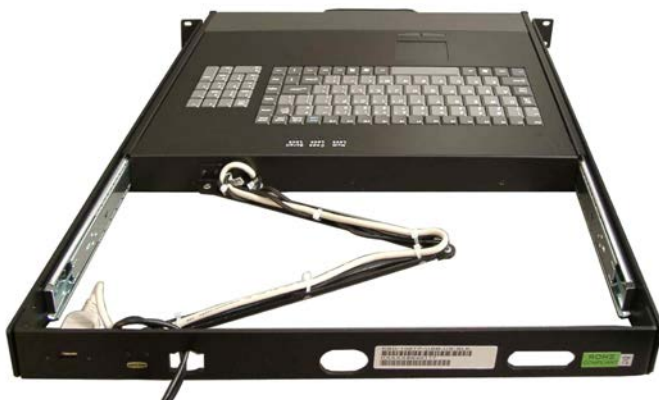
Rackview Rear Slide Extension

The RackView can be placed at any height within a standard 19" rack. This offers the operator the maximum in comfort and takes up a minimum amount of rack space. The front panel conceals the unit when it is not in use.