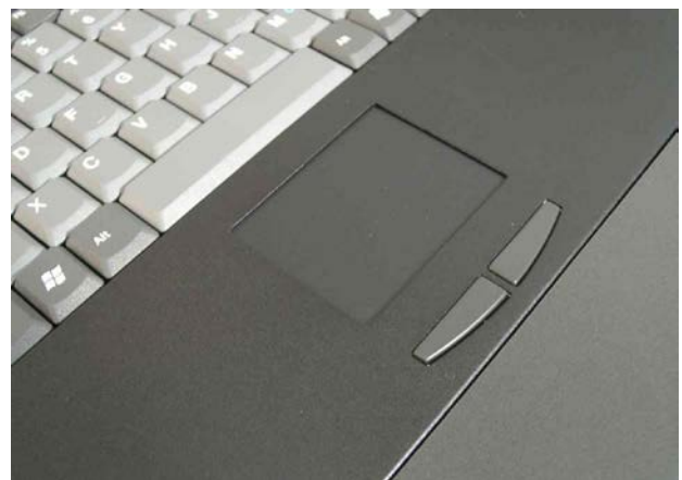
Rackview Touchpad Mouse