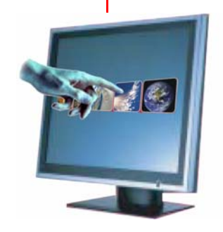
Easy access right at your fingertips