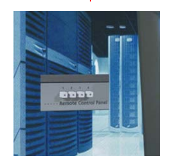
Connect to a CPU with the push of a button

Video switching applications, presentations, training sessions, and many other applications are made easy by using the push-button features of the Remote Control Panel.