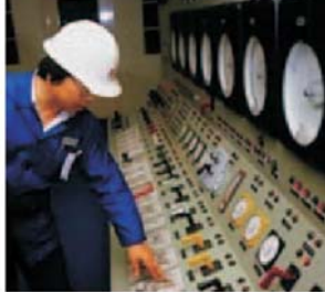
Connect up to 9 peripherals