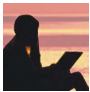
Maintain your systems from anywhere in the world

The remote client viewer program is designed to simplify accessing the remote computers. Click on the connect icon, login, and you will see a crisp, clear, high-quality image of the remote computer.