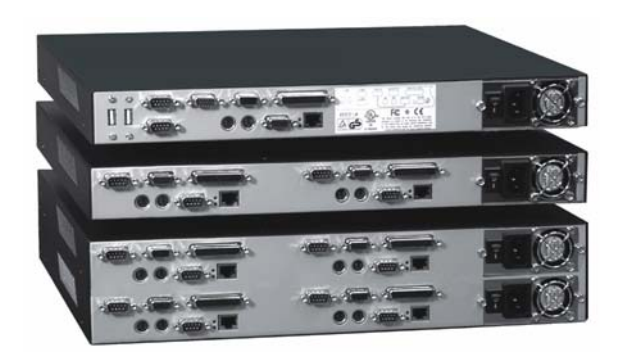
Rear view - UL-V3 / UL-DV3 / UL-QV3

■ Phone: 281-933-7673 ■ E-mail: sales@rose.com ■