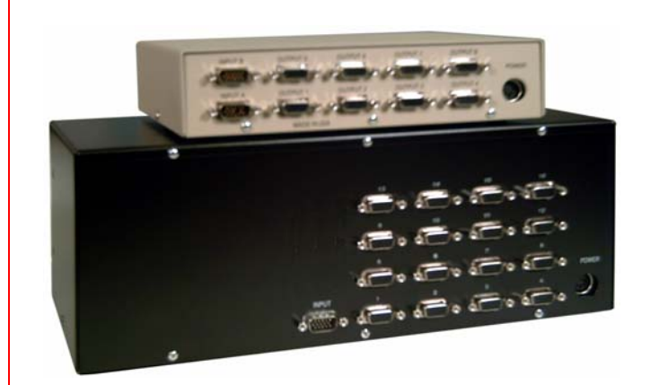
VSP-2X8VB model (top) / VSP-1X16VB model (bottom)