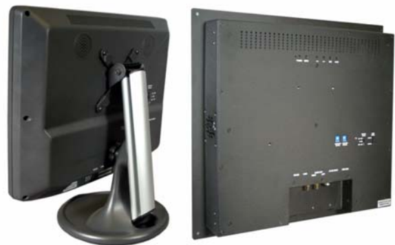
Rearview – display and panel mount models