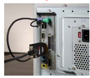
Direct connect CAT5 Transmitter streamlines your installation

Europe and Asia, Rose provides a full range of capabilities and support. Call us today for more information about this and other Rose products.