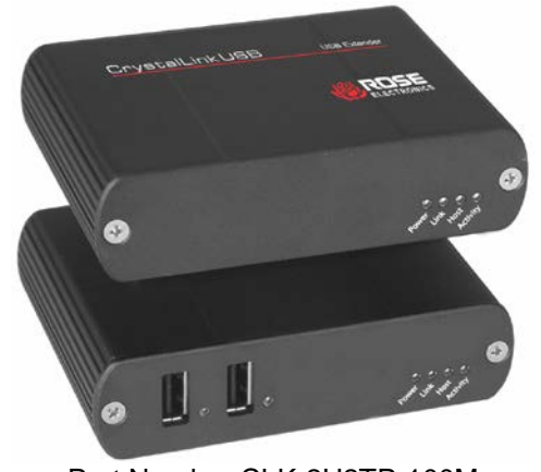
Part Number CLK-2U2TP-100M