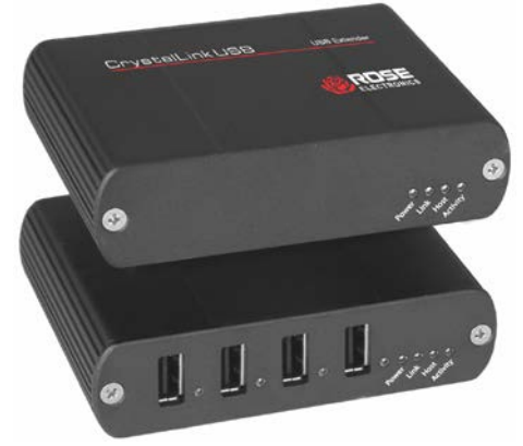
Part Number CLK-4U2TP-100M