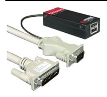
Figure 3. Uniport (Cable)

Keyboard – USB Type A Mouse – USB Type A Video – HD15F Switch – DB25M