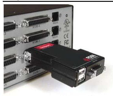
Figure 4. Uniport to a switch

Connect the DB25M connector to the DB25F KVM port on a Rose KVM switch. Next connect your USB keyboard and mouse to the USB Type A connectors on the Uniport. Connect the video cable (HD15M) to the Uniport's HD15F connector.