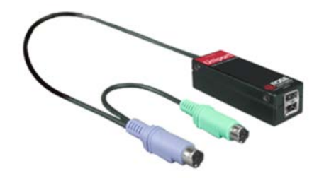
Figure 2. Uniport (In-Line)

Keyboard – USB Type A Mouse – USB Type A Keyboard port – PS/2 Mouse port – PS/2