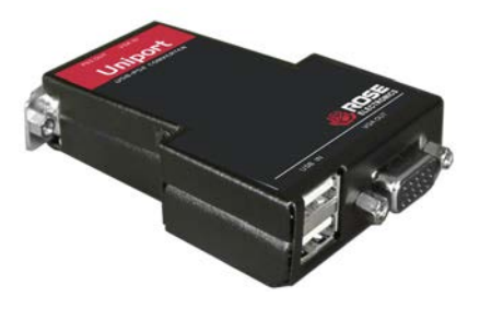
Figure 1. Uniport (Direct connect)

Keyboard – USB Type A Mouse – USB Type A Video – HD15F Switch – DB25M