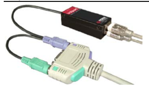
Figure 5, Uniport to a KVM cable

Connect the Uniport's PS/2 keyboard and mouse connectors to the corresponding PS/2 connectors on the KVM cable. Connect the video monitor cable if it was disconnected, to the HD15M connector on the KVM cable.