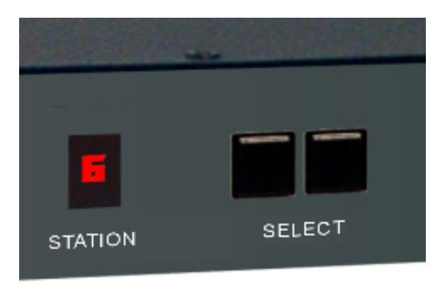
Figure 3. Front Panel

The select buttons sequentially select (scroll up or down) which DVI input signal to route to the DVI output. The station indicator shows which DVI input port is selected.