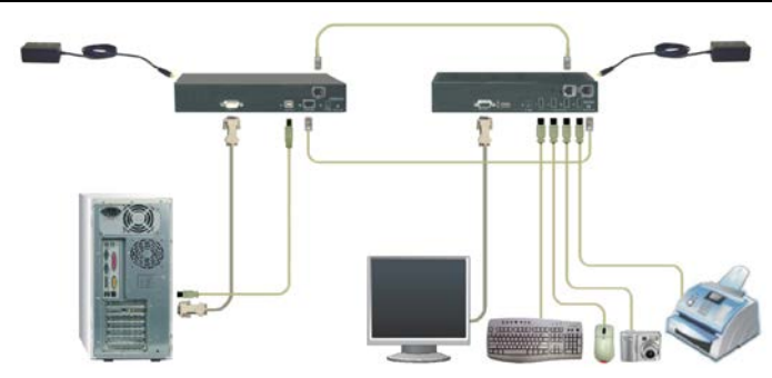
Single, Dual or Quad video <<< USB Devices >>>

Depending on your model, cables and rear panel connectors will vary. Dual and Quad models connect with additional video cables and CAT5 cables.